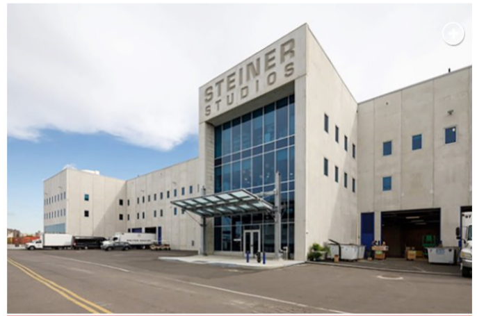
Steiner Studios in the Brooklyn Navy Yard

It's full of wartime ghosts, such as the radio towers atop Steiner's building at 25 Washington Ave. (which are lit blue at night) and the romantic ruins