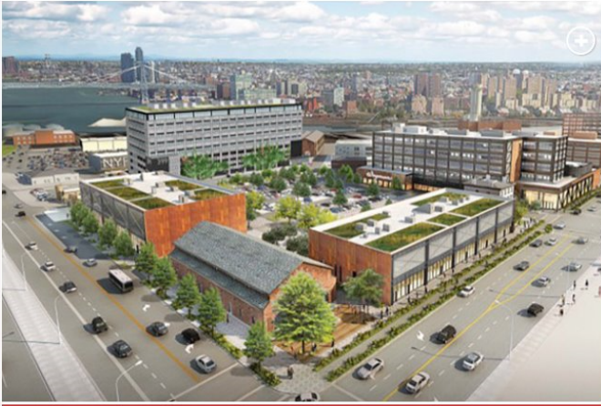
Rendering of Admirals' Row at Brooklyn Navy Yard with Wegmans store at top right.

The booming Brooklyn Navy Yard, where mighty World War II battleships were launched, has scores of more peaceful new stories to tell. Owned by the city since 1966, the contemporary industrial park now boasts a daily workforce of 9,500, up from 3,600 in 2001, and on track to more than double to 20,000 by the end of 2020.